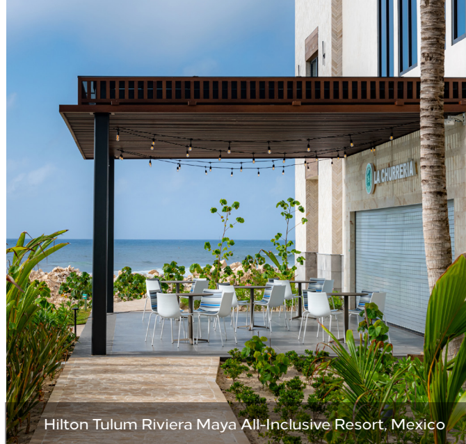
Hilton Tulum Riviera Maya All-Inclusive Resort, Mexico

It's the perks of paradise in one convenient price tag at our rapidly expanding all-inclusive resorts throughout Mexico and the Caribbean. From milestone celebrations to family fun or simply indulgent alone time, nothing beats the ease of an all-inclusive resort for an all-extraordinary getaway.