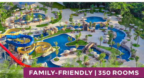
FAMILY-FRIENDLY | 350 ROOMS