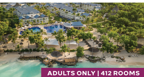
ADULTS ONLY | 412 ROOMS

Enjoy championship golf, the pool or spa while kids delight in the Kids or Teens Club or the new water park. Spacious rooms and suites, plus fine dining, complete the ease.